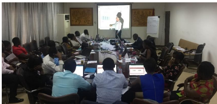
Training on Private Partnerships Fiscal Risk Assessment Model (PFRAM), Oct. 29

In Ghana , over 20 Ministry of Finance staff received training on evaluating the Public-Private Partnerships Fiscal Risk Assessment Model (PFRAM), project finance, and evaluation and financial modeling. The Boankra Inland Port was analyzed as a case study during the practical training. In Sierra Leone and The Gambia , the missions assisted in the revision of the Chart of Accounts, to facilitate program-based budgeting and the preparation of GFS reports in the future.