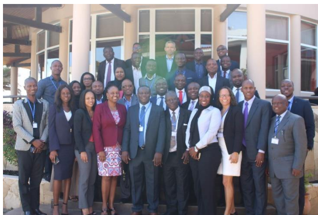
Participants in the Regional Workshop on Stress Testing, Cabo Verde, December 4, 2018

In the Financial Sector Regulation and Supervision, CD was provided to the supervision divisions of the regional central banks to continue to build capacity in IT Supervision, preventing IT Fraud and Enhancing Credit Analysis ( Liberia and Sierra Leone ). AFW2 also supported the improvement of supervision and reporting structures to comply with Basel II/II and IFRS 9 Standards ( Gambia and Ghana ). A regional workshop focused on stress testing, as a means of facilitating regional peer-to-peer learning.