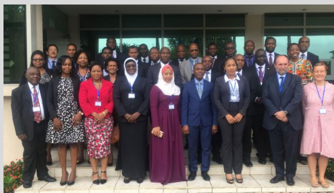
Participants at the CPSS-IOSCO PFMI Regional Workshop in Accra, Ghana

For MONOPs, AFW2 and AFRITAC East jointly held a week-long regional workshop on the Principles for Financial Market Infrastructures (PFMI) in Accra, from October 29 – November 2, 2018 . It was attended by 25 officials from 11 central banks and the West African Monetary Institute (WAMI). The workshop aimed to enhance the level of proficiency in the new international standards and to support efforts towards compliance and discuss current development in the FMI landscape.