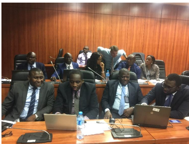
Central Bank of Nigeria officials during a hands-on training on monetary policy analysis, Dec. 3

TA delivered in MONOPS involved continued support in improving monetary policy analysis ( Nigeria and Sierra Leone ), payment system oversight ( The Gambia and Liberia ), monetary operations ( Liberia ) and FX operations ( The Gambia ). Additionally, missions were conducted to support countries to improve compliance with CPSS-IOSCO Principals, especially in the risk assessment of real-time gross settlement systems ( Bank of Ghana ). 1 A joint regional effort between AFW2 and AFE, also provided training in a regional workshop on current payment system oversight issues in October.