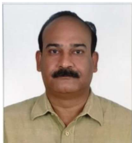
Regional Advisor Public Financial Management