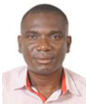
Admin. Assistant/IT Officer