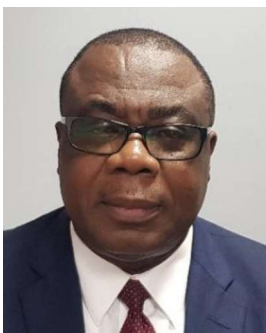
Regional Advisor Banking Supervision