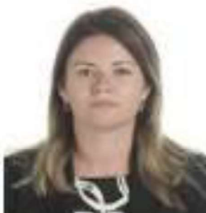
Regional Advisor Real Sector Statistics