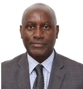
Regional Advisor Revenue Administration (Tax)