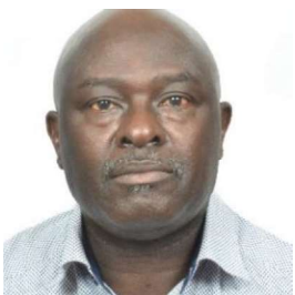
Regional Advisor Public Financial Management