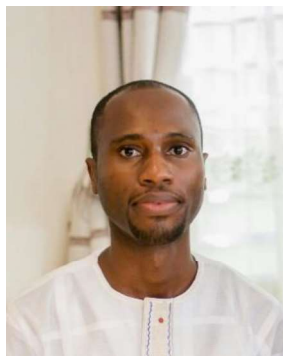
Project Officer (Results Based Management)