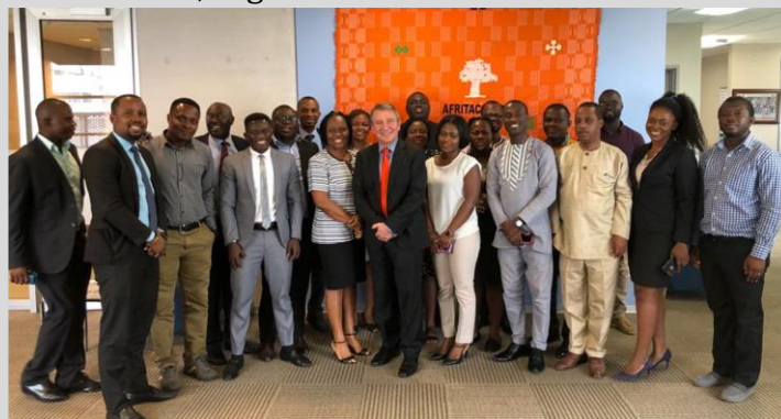
Fiscal Risk Management for PPP, Ministry of Finance, Ghana

Risk management and budget forecasting capabilities were improved in Ghana, Nigeria and Sierra