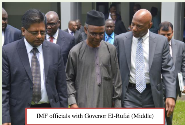
IMF officials with Governor El-Rufai (Middle)

AFRITAC West 2 conducted a regional workshop on the design and implementation of the Treasury Single Account (TSA) for its member countries. As many of the AFW2 countries are pursuing TSA as part of their PFM reforms, the workshop acquainted country authorities with good practices in TSA design and implementation. It also provided a platform to share experiences across the AFW2 region particularly as they relate to recent developments and current practice and identified necessary actions to be taken in each AFW2 country to ensure a successful TSA implementation. The closing ceremony of the workshop was addressed by Honorable Nasir El-Rufai, Governor, Kaduna State, Nigeria who also launched the Kaduna State TSA Operations Manual which was developed with TA from AFW2.