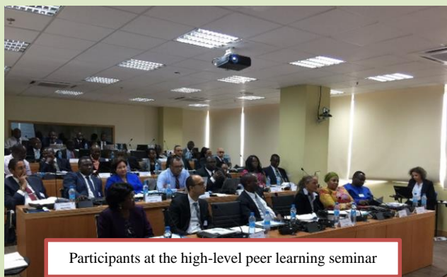
Participants at the high-level peer learning seminar

From November 3 - 11, the IMF through a collaboration between its Africa Training Institute (ATI), Africa Department, Monetary & Capital Markets (MCM) Department and the Institute for Capacity Development (ICD) conducted a two-day peer learning seminar on modernizing monetary policy frameworks in Mauritius.