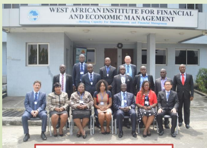
Facilitators and participants at the workshop

In collaboration with the WAIFEM, AFW2 held a 4-day payment system regional workshop for AFW2 central banks. The purpose of the workshop was to discuss the industry-standard CPSS-IOSCO Principles for FMI compliance issues with senior payment and settlement systems officials involved in both operations and oversight and support their respective central banks' efforts towards compliance. The event provided the participants with a forum to exchange ideas on compliance and assessment challenges facing the authorities and how compliance may be achieved in spite of the challenges. Current developments and new trends such as cyber security and 'FinTech' (the extensive use of new financial technologies in the payment and settlement system) were also discussed. Participants also had the opportunity to assess the financial market infrastructure in their respective countries. Participants at the workshop particularly appreciated the very well-structured and delivered case study on the payment system of a fictional African country, Afrinia.