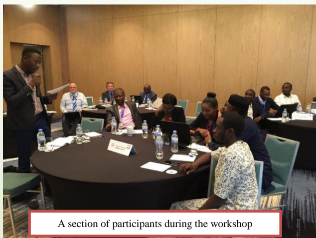
A section of participants during the workshop

November 28 - December 2, Kigali, Rwanda (PFM)