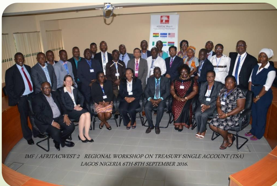
IMF / AFRITACWEST 2 REGIONAL WORKSHOP ON TREASURY SINGLE ACCOUNT (TSA) LAGOS NIGERIA 6TH-8TH SEPTEMBER 2016.

AFW2 conducted/participated in the following workshops: