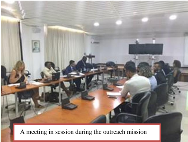
A meeting in session during the outreach mission

During October 17-20, the Center carried out an outreach mission to Cabo Verde led by the Center Coordinator and comprised the Advisors for Public Financial Management (PFM), Revenue Administration and Real Sector Statistics. The team met with the Minister of Finance as well as the senior staff of the Ministry, the National Directorate for the State Revenues (DNRE) and the National Statistics Institute. Based on the discussions, the mission agreed with the authorities on priority capacity building reforms under each sector which could be supported by the Center.