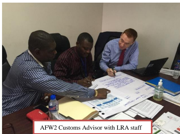
AFW2 Customs Advisor with LRA staff