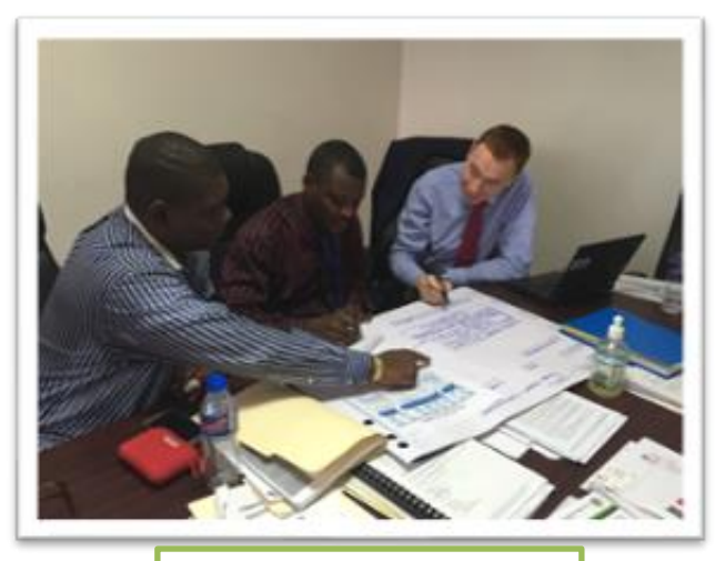
Customs Advisor with LRA staff

Standard Operating Procedures have been approved for implementation.