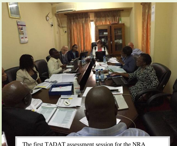
The first TADAT assessment session for the NRA

A TADAT mission was conducted in Sierra Leone for the National Revenue Authority (NRA) with some support from AFW2. AFW2's Revenue Advisor participated in the mission.