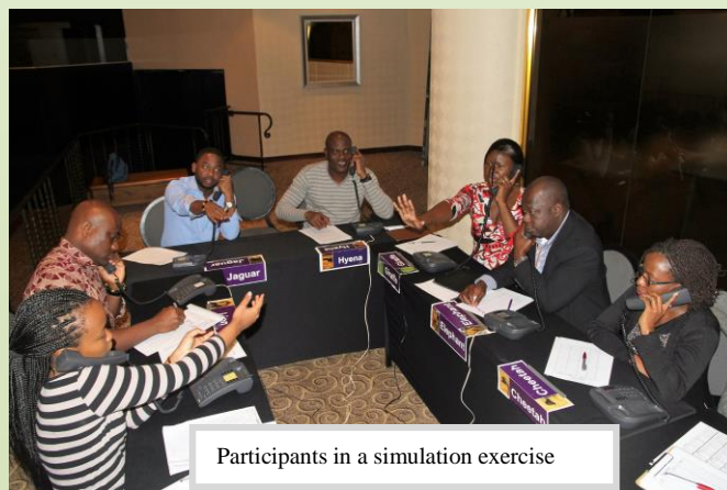
Participants in a simulation exercise

This was an intensive training program tailored to central banks covering market conventions, intervention techniques and the role of central banks in the foreign exchange markets and forward transactions. With participants drawn from central banks in AFW2 and AFE, the course provided officials involved in foreign exchange operations a close to real life simulation of foreign exchange market environment. It also provided an excellent forum for officials from West and East African central banks to meet and exchange experiences. For AFW2, central bank officials from Ghana, Liberia, Sierra Leone and The Gambia participated in this training workshop.