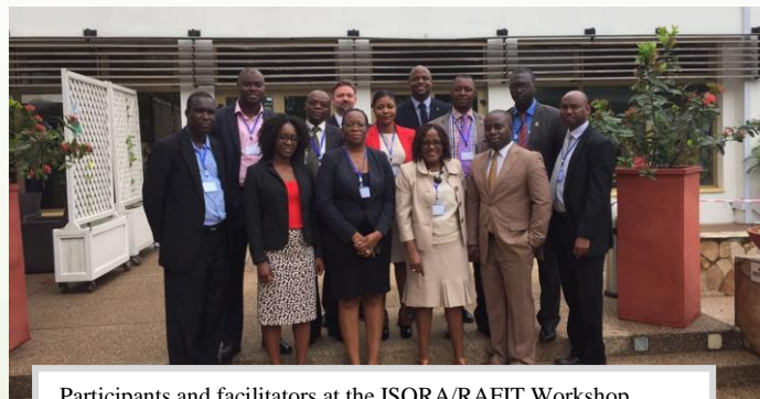
Participants and facilitators at the ISORA/RAFIT Workshop

Administration Diagnostic Assessment Tool (TADAT). The first three days of the workshop was dedicated to the ISORA/RA-FIT and covered how to measure and manage performance in tax administrations using the ISORA run on the IMF's RA-FIT data collection platform. Participants also shared their country experiences and challenges with implementing various instruments and tools for managing performance in their Tax Administrations.