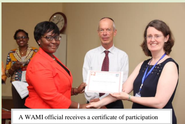
A WAMI official receives a certificate of participation

The BCPs set the minimum standards for the regulation and supervision of banks and it is important that regulatory authorities; i.e. Central Banks evaluate themselves against the principles to ensure that their operations align with international requirements.