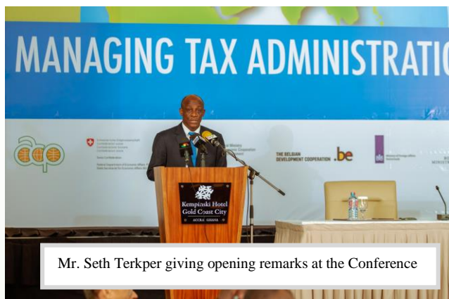
Mr. Seth Terkper giving opening remarks at the Conference

The conference which was opened by Mr. Seth Terkper, Minister of Finance of Ghana marked the culmination of five years of experience under the Tax Policy and Administration – Topical Trust Fund (TPA-TTF) program with tax administration reforms in approximately twenty low and lower-middle income countries in three regions: Asia, Latin America and Sub-Saharan Africa.