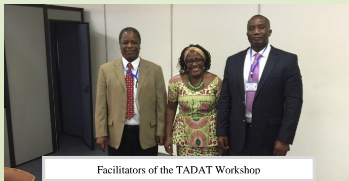
Facilitators of the TADAT Workshop

This was followed by a 2-day awareness training for the officials on the Tax Administration Diagnostic Assessment Tool (TADAT) delivered by the TADAT Secretariat and the AFRITAC East (AFE) Revenue Advisor who shared the experience of AFE countries with TADAT Assessments. Countries represented were encouraged to have TADAT assessments done for the tax administrations which would help in prioritizing reform program activities.