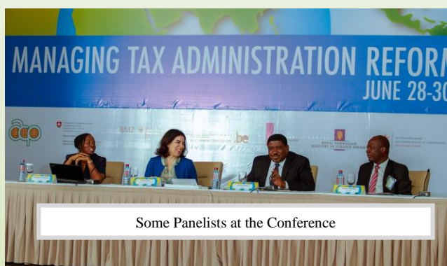
Some Panelists at the Conference

The conference which was opened by Mr. Seth Terkper, Minister of Finance of Ghana marked the culmination of five years of experience under the Tax Policy and Administration – Topical Trust Fund (TPA-TTF) program with tax administration reforms in approximately twenty low and lower-middle income countries in three regions: Asia, Latin America and Sub-Saharan Africa.