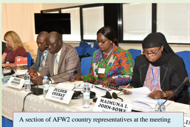
A section of AFW2 country representatives at the meeting

AFW2's fifth SC meeting was held in Praia, Cabo Verde on April 28, 2017 chaired by His Excellency Olavo Correia, Minister of Finance for Cabo Verde. Representatives of AFW2 member countries, Development Partners, Economic Community of West African States (ECOWAS) Commission, West African Institute of Financial and Economic Management (WAIFEM) as well as IMF staff from the Center and Headquarters participated in the meeting.