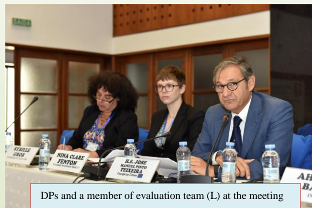
DPs and a member of evaluation team (L) at the meeting

implementation of the Center's work program for the last fiscal year and approved the work program for Fiscal Year 2018. The inception note of the ongoing mid-term evaluation of AFW2 was presented and discussed at the meeting. The SC was also briefed on the ongoing roll-out of the Fund-wide Results-Based Management at the Center.