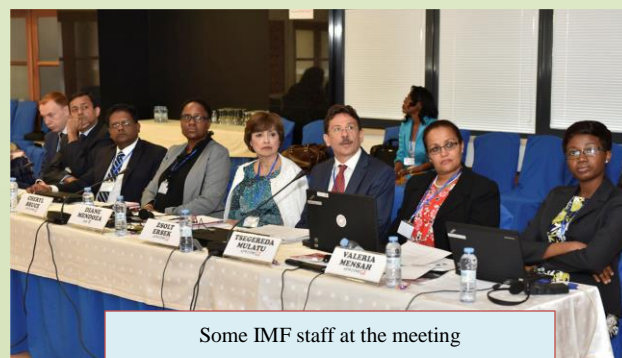
Some IMF staff at the meeting

A documentary video was premiered at the meeting featuring high-level public officials who gave feedback on the Center's work in the various AFW2 member countries.