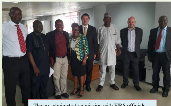
The tax administration mission with FIRS officials

An HQ-led mission visited Nigeria on tax administration. The mission overlapped and coordinated its activities with a parallel customs administration mission funded by the Government of Japan. The two AFW2 Revenue Advisors participated in the mission.