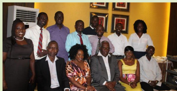
BOG and CBG participants of the program

The Bank of Ghana facilitated another attachment in Financial Sector Supervision by hosting four examiners from the Central Bank of The Gambia. The BOG took them through the process for reviewing the implementation of IFRS principles with participants reviewing annual reports and taking part in relevant meetings. The visiting examiners found that the attachment strengthened their understanding of processes to be followed.