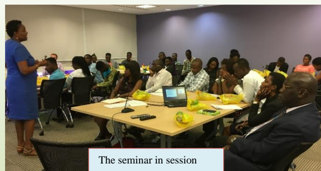
The seminar in session

On January 26, 2017, AFRITAC West 2 facilitated a staff volunteer seminar on “Managing Personal Finances” in Accra as a pilot outreach program for the Center. The seminar’s objective was to leverage of staff expertise to support efforts to promote financial literacy and financial inclusion in AFRITAC West 2 member countries.