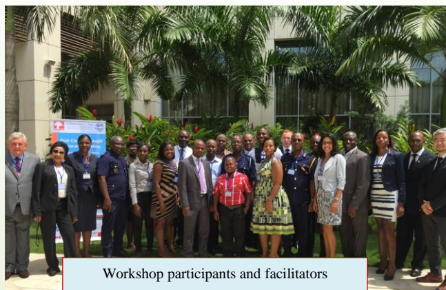
Workshop participants and facilitators

The workshop was designed and delivered in partnership with the World Customs Organization, the South African Revenue Service and the Ghana Revenue Authority (GRA). The workshop discussed at a more technical level, the design and implementation of effective PCA systems and processes in accordance with the World customs Organization (WCO) PCA Guidelines and other best practice standards. Participants learned about best practice and shared their experiences from across the region. Working with support from an IMF Technical expert the participants worked collaboratively to develop a series of Action Plans to implement their learning. Feedback from the week was highly positive with the newly appointed Commissioner Customs of the GRA and a representative from the business community taking an active role in many of the sessions.