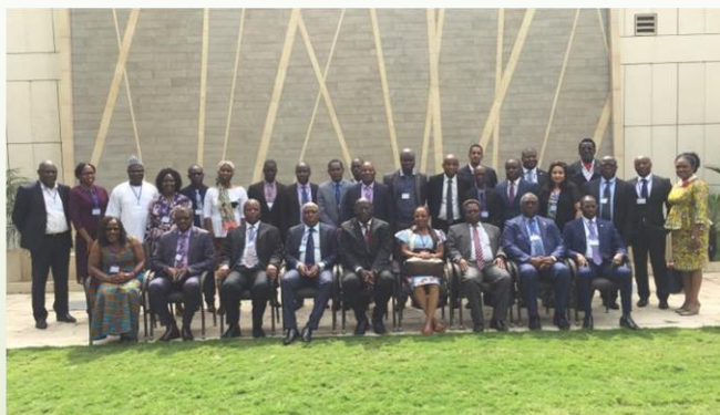
Participants and facilitators of the Workshop with AFW2 CC (M)

AFW2 conducted a regional TADAT Leadership seminar for Commissioners and Commissioner General (CGs) of revenue authorities in AFW2 member countries.