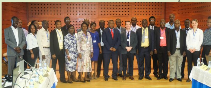
Facilitators and participants of the workshop

The workshop was attended by officials from statistics offices in all six AFW2 countries. The workshop