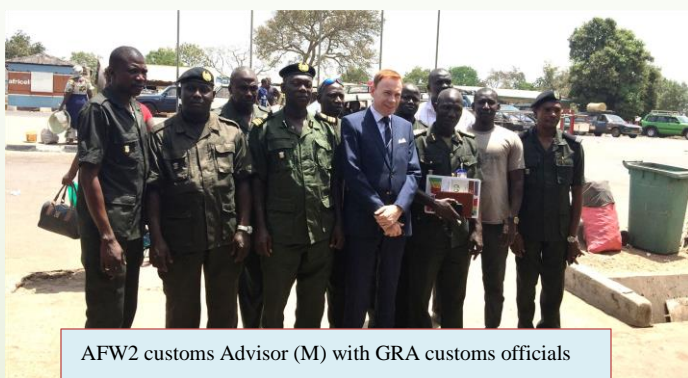
AFW2 customs Advisor (M) with GRA customs officials

AFW2 delivered an audit training for the NRA as part of the regional audit training program. Two previously trained trainers from Nigeria Federal Inland Revenue Service (FIRS) joined in the delivery of the training.