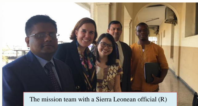
The mission team with a Sierra Leonean official (R)

Hands-on training was provided to strengthen capabilities for the analysis of cash flow data and in general build capacity within the CMU.