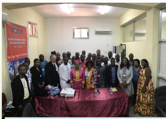
Facilitators and participants with NRA Commissioner General (M)

To assist AFW2 member countries to improve domestic resource mobilization, AFW2 has embarked on a data matching project with various member countries as part of measures to promote compliance using more effective risk-based compliance management and enforcement. As part of this effort, a one week regional training workshop on data matching and analysis tools was organized for public officials from all the six AFW2 revenue agencies. Specifically, this training helped to strengthen capacity to use third party data to identify revenue leakages.