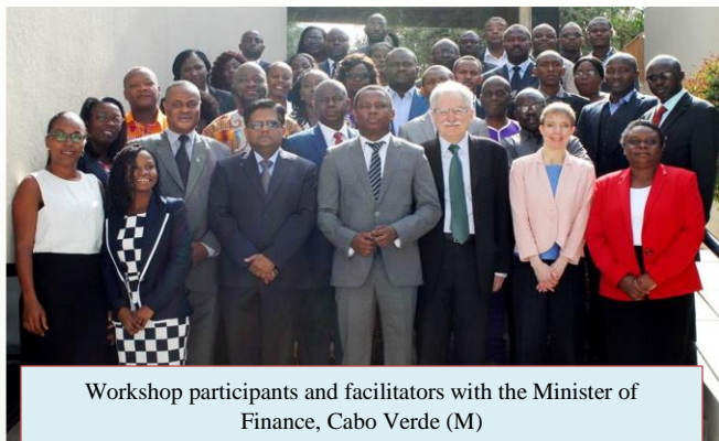
Workshop participants and facilitators with the Minister of Finance, Cabo Verde (M)

This was an inter-RTAC collaborative workshop which brought together 36 public officials from AFW2 member countries and other Lusophone countries in Africa. The main objectives of the workshop were to provide officials with an opportunity to identify factors affecting alignment between strategic plans and annual budgets, share relevant international and regional examples of approaches to improving coordination, and identifying necessary actions to be taken in each participating country to achieve such strengthened coordination