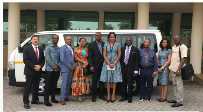
AFW2 MONOPS Advisor (L) with participants of the program

the payment systems supervision, as well as the oversight activity of the BOG. Upon returning home the participants had to share with the Center their takeaway from the program and planned changes in their daily work based on the experiences.