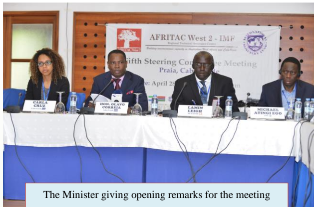
The Minister giving opening remarks for the meeting