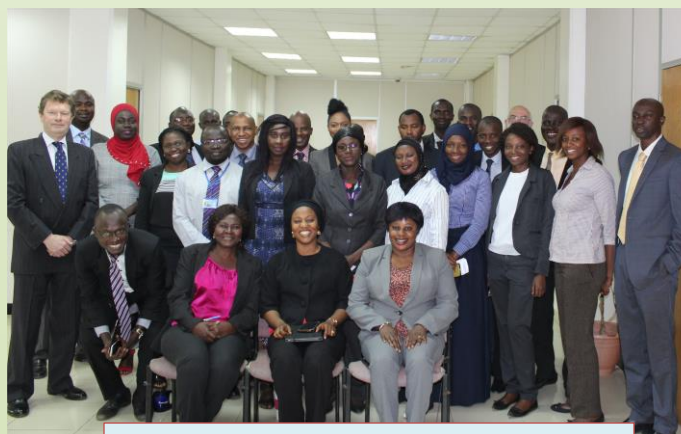
CBG staff with the facilitators of the Basel II/III training

The mission, conducted in a training format sensitized authorities on the key requirements of the Basel II/III standardized approaches and motivated progress towards implementing its relevant aspects.