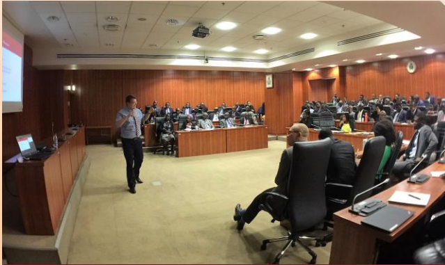
STX Mark Fukač addresses staff of the Central Bank of Nigeria

A diagnostic mission on macroeconomic policy analysis was conducted at the Central Bank of Nigeria to assess the TA needs of the central bank to work out a medium-term development plan. Efforts resulted in initial recommendations for the plan, including strengthening the diagnostic and presentation skills of the Monetary Policy Committee (MPC) staff, to archive intended outcomes for Nigeria. While the mission team observed well-developed MPC processes, it was clear that TA would need to focus on strengthening medium-term economic outlook and forecasting models.