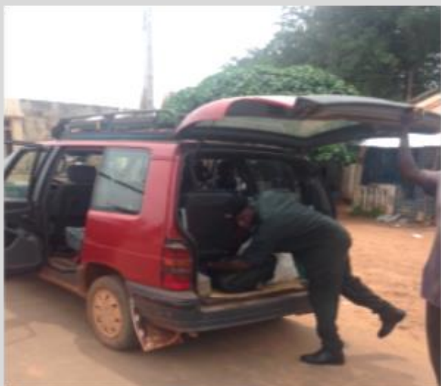
A Gambia Revenue Authority (GRA) Officer searching a vehicle at Farafenni, a Gambian border with Senegal as part of a Risk Management exercise.

A customs mission provided support to the Intelligence, Investigation and Risk Management Unit of the Gambian Revenue Authority (GRA) with the implementation of a National Intelligence (NI) and Risk Management (RM) strategies. The activities included field exercises at borders to improve intelligence. Implementation of the completed strategies are scheduled for subsequent missions, in order to make customs control more efficient and strengthen the enforcement of audit and anti-smuggling laws.