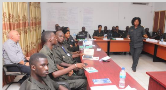
Trainers from the GRA instruct the group at the induction training.

AFW2 delivered training to 20 customs officers of the Gambian Revenue Authority (GRA), to design and deliver training solutions. The goal of this mission was tied to a milestone within the Results-Based Management (RBM) logframes developed for the Gambia by AFW2, that focused on the preparation of training modules and a group of trainers for the GRA. This phase built on prior missions to finalize and pilot the Customs Induction Training module, train the customs officers, as well as review progress with the development of the GRA training strategy, policy and training plan. Additionally, field activities included practical sessions at Port Banjul where live examinations of consignments resulted in officers successfully detecting and penalizing small value undeclarations.