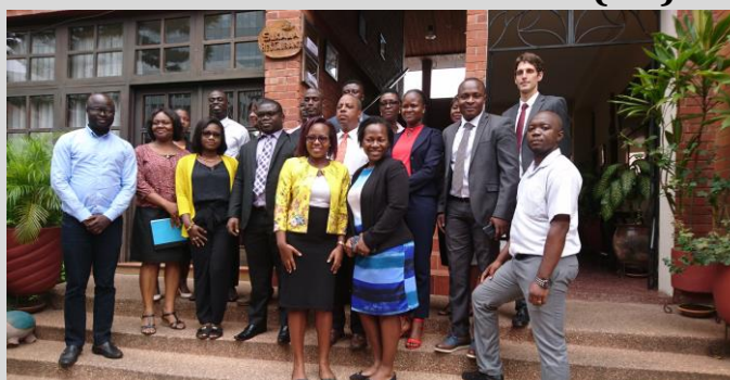
Participants in the Project Prioritization training mission held August 27 to September 5, 2018 in Ghana.