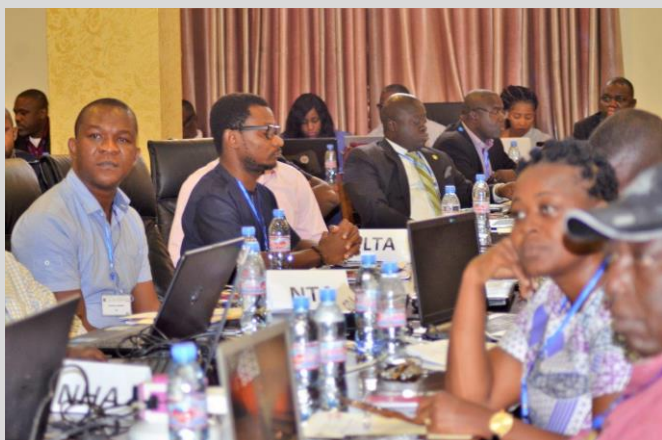
Staff of the State-Owned Enterprises Reporting and Coordination Unit of the Ministry of Finance and Development Planning

A PFM mission provided support to the State-Owned Enterprises (SOE) Reporting and Coordination Unit of the Ministry of Finance and Development Planning to improve financial reporting and assist in the process of adopting international accounting principles and standards as required under regulations to the 2009 Public Financial Management Act (PFMA). The mission engaged in the review of progress made against recommendations made in previous missions and an IFRS gap analysis. Training was also provided to build capacity in SOE financial reporting templates and IFRS concepts, with hands-on practice with the aim of strengthening central fiscal oversight and analysis of sub-national government risks.