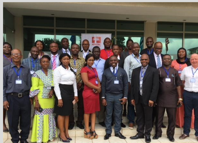
Participants at the Price Statistics and Indexes workshop in Ghana.

AFW2 conducted a one-week workshop to build capacity of statisticians from the national statistics bureau to improve the compilation of price statistics with an emphasis on updating consumer and producer price indexes. It involved interactive discussions of country experiences and challenges with price statistics compilation to encourage peer learning. There were also lectures and practical exercises to apply concepts and methods.