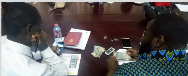
“Estimating your personal discount rate.” Staff of the PID engage in a simulation exercise conducted during the training.

Training was provided to staff of Public Investment Division (PID) in the Ministry of Finance and Economic Planning (MoFEP) on the standard criteria and methods for the appraisal, selection, and prioritization of publicly-funded projects. Trainees were introduced to the cost benefit analysis and multi-criteria analysis as tools for a more structured approach to pre-screening projects. The training was enforced with practical sessions using Excel templates, which was well received by the trainees. This mission laid the groundwork to further progress in improving project selection processes.