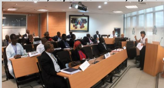
Participants listen attentively to the instructor's presentation.

This workshop exposed senior central bank staff and top management from The Gambia, Ghana, Liberia, Nigeria and Sierra Leone on the concepts of monetary policy communication. The AFW2 aims at reinforcing the importance of communication to the central bank for the education of stakeholders on objectives and operational targets. It was designed to equip participants with tools and techniques to improve their communication skills.