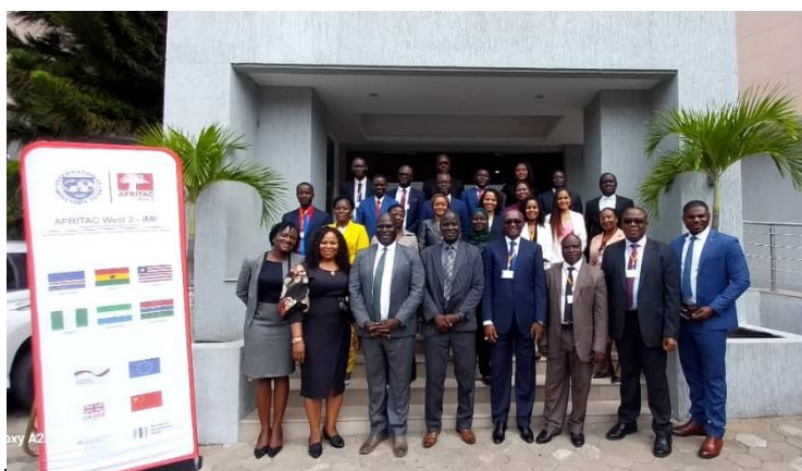
Participants at the joint AFW2/WAIFEM workshop on improving risk-based supervision for NBFIs

challenges encountered by many countries in the region. Key challenges include the need to optimize FX policies to mitigate the spill-over effects of global monetary policy in the wake of the war in Ukraine and the normalization of monetary policies in advanced economies following the global financial crisis in 2007/08 and the Covid-19 pandemic.