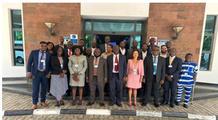
Participants at the 1 st AFW2 CD in insurance supervision, focusing on regional implementation of IFRS 17.

consumer confidence and financial inclusion for the underserved. Participants, comprising 21 senior supervisors from the 6 member countries and the West African Monetary Institute (WAMI), delivered presentations on portfolio tracking practices, challenges, and outlook, and shared their experiences. Participants expressed gratitude for the opportunity to enhance their knowledge in international and regional best practices for regulation of NBFIs.