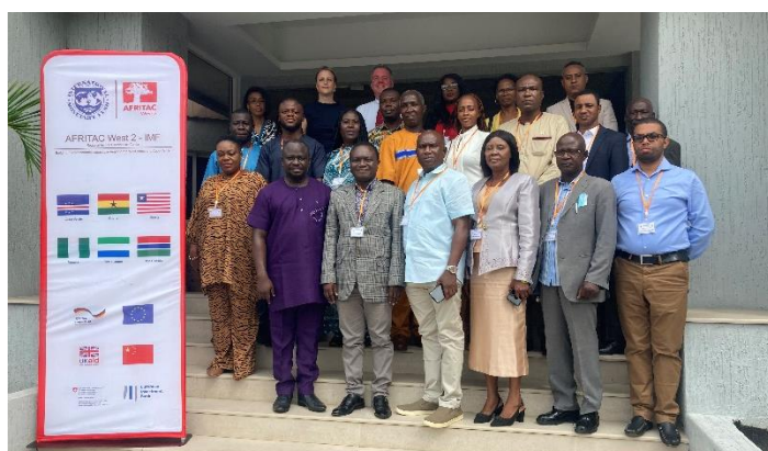
Participants at the joint AFW2 workshop on Producer Price Index statistics

challenges, and areas of CD support, and fully participated in the interactive sessions. During the workshop, each country was assisted to develop relevant milestones to improve IFRS 17 project plan (Ghana and Nigeria), or a comprehensive integrated project plan, including legal framework, risk-based capital, and milestones (Cabo Verde, Liberia, Sierra Leone, and The Gambia). Areas for future CD support were identified and discussed with participants.