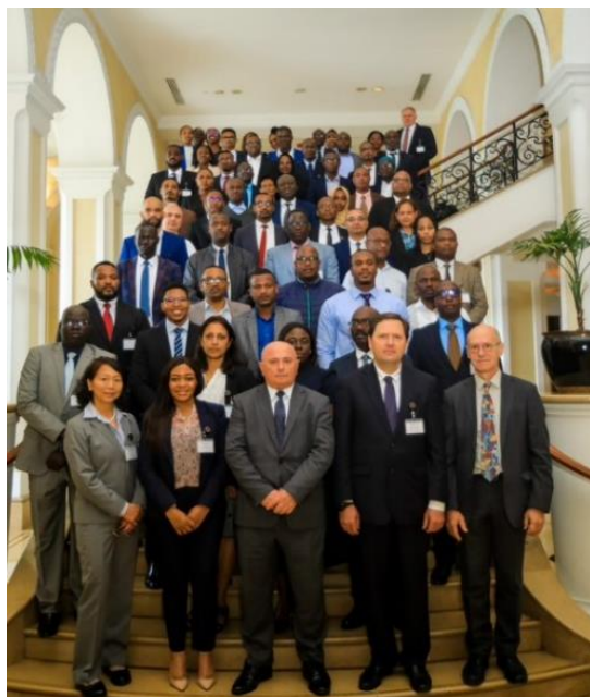
Group photo of all participants of the workshop on FX Policy & Operations