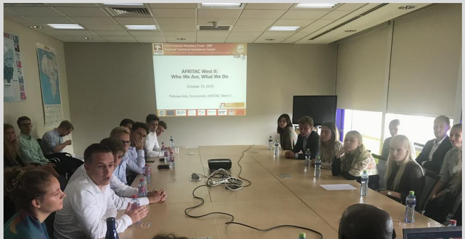
Students from the University of Copenhagen at AFRITAC West II in Accra.

AFW2 work program execution at mid-year is on course, picking up momentum from the beginning of FY 2020. Thirty-five (35) TA missions, four (4) regional workshops and a professional attachment were completed in the period August – October 2019.