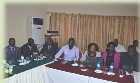
Participants from the Central Bank of The Gambia at the IFRS training in Banjul.

A technical assistance (TA) mission visited to assist the authorities in developing an understanding of the requirements of the IFRS accounting standards. This was the first of two missions with the second mission currently in progress.