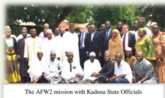
The AFW2 mission with Kaduna State Officials

The Center Coordinator (CC) joined a PFM mission to Nigeria which met with officials from the Office of the Accountant General of the Federation, Abuja and the Kaduna State Government. The CC used the opportunity to interact with the officials on the operations of the Center.