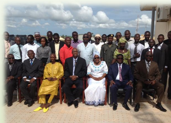
The CAAT training in Banjul, August 2015

AFW2 trained GRA tax auditors from the Gambia Revenue Authority (GRA) on Computer Assisted Audit Techniques (CAAT) to improve efficiency and audit yield.