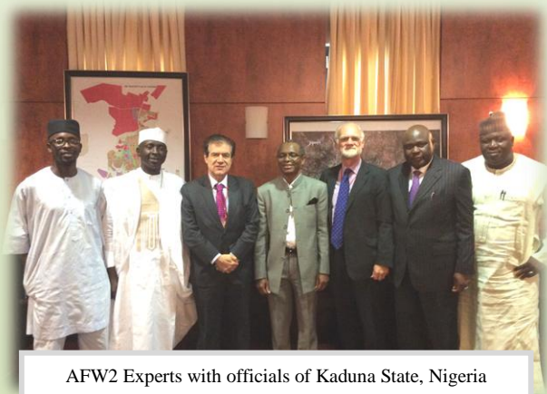
AFW2 Experts with officials of Kaduna State, Nigeria

In response to a request from the Federal Government of Nigeria (FGN), an AFW2 technical assistance mission visited Kaduna, to assist the State authorities with reviewing and updating the reform